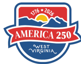
Full-Color For Light Colored Background