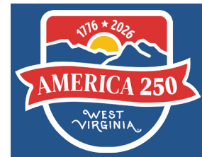
Full-Color For Dark Colored Background