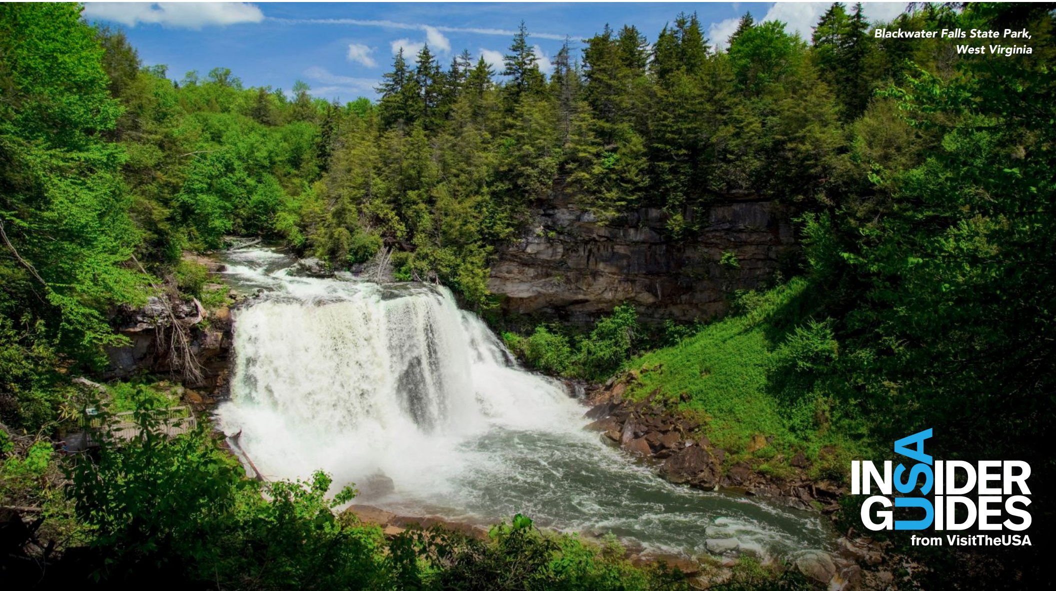
Blackwater Falls State Park, West Virginia

Accommodation: Blackwater Falls State Park, West Virginia