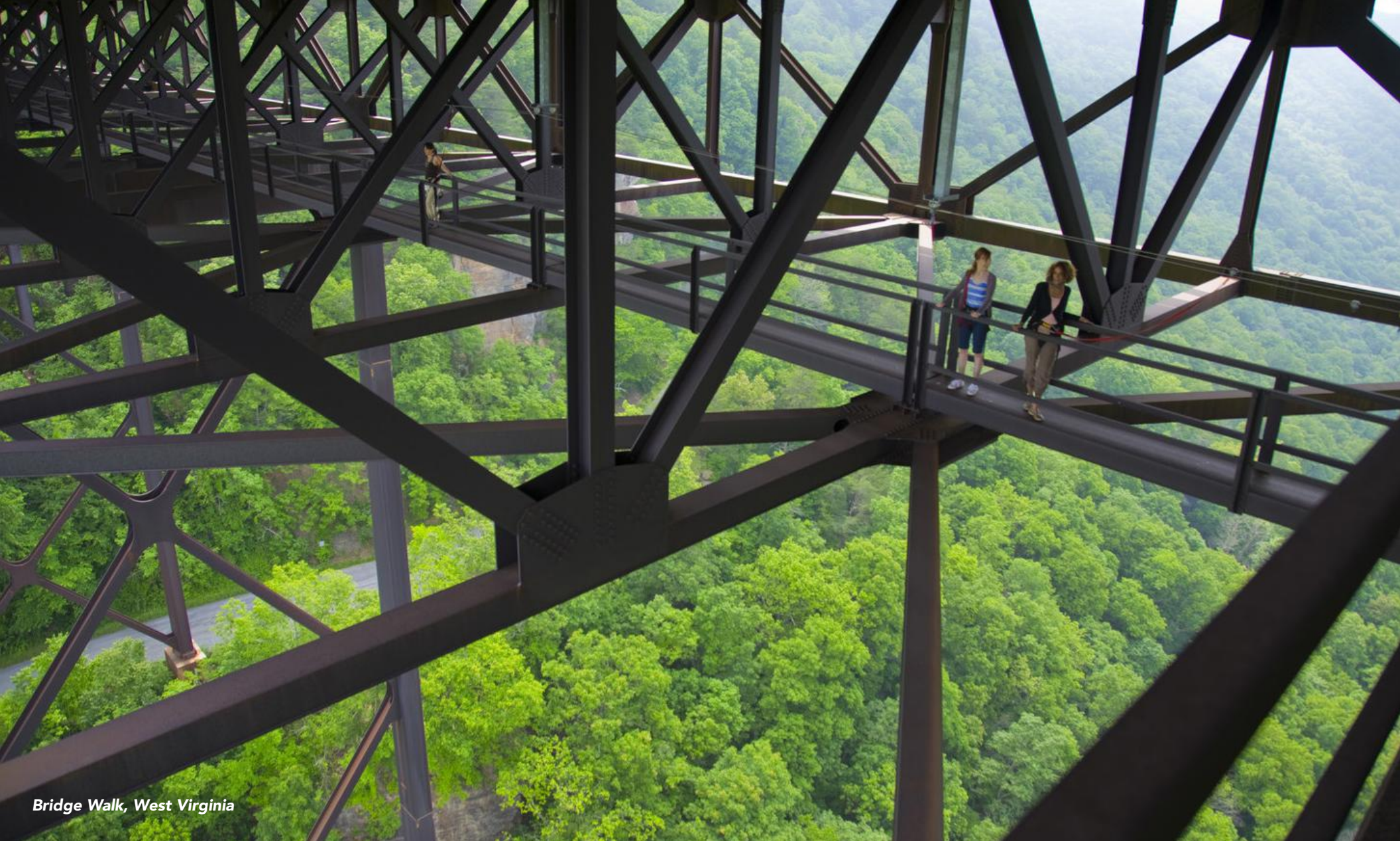
Bridge Walk, West Virginia